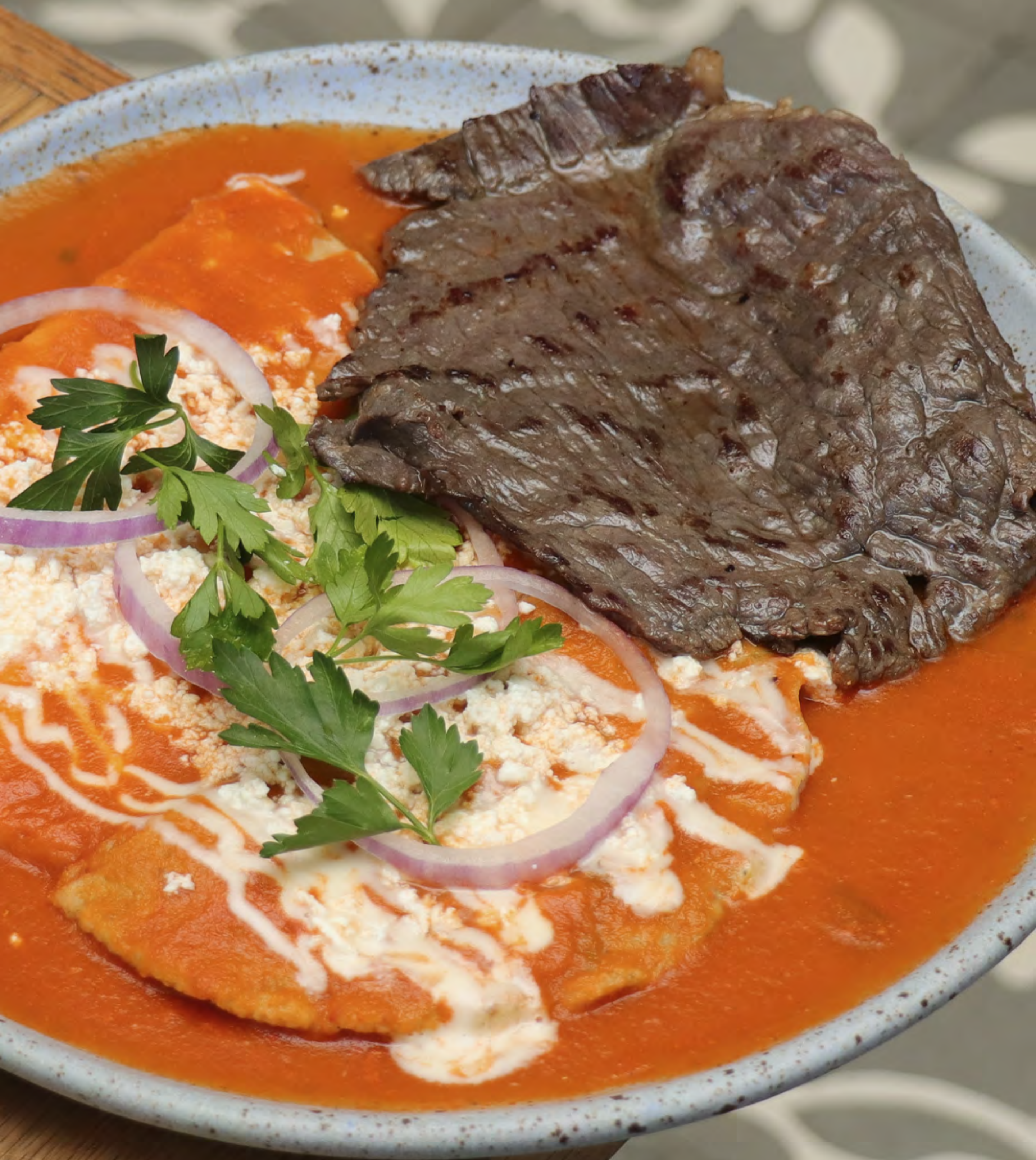
EN TOMATADAS WITH TASA JO BEEF